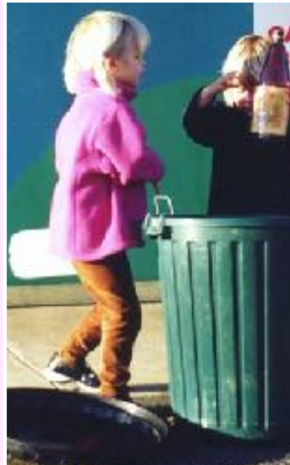
Take out the rubbish