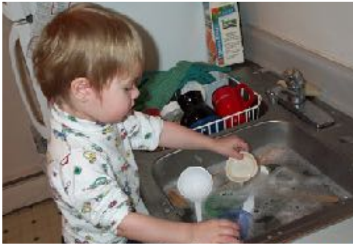
I can wash up