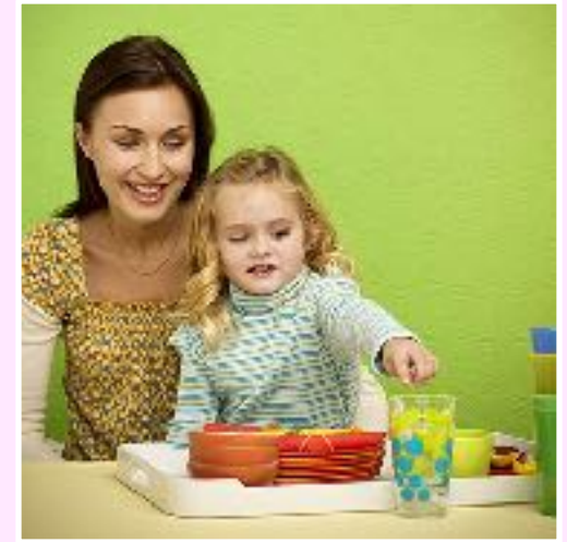
Set the table